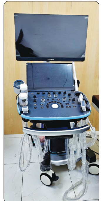
Kaushalya Hospital installed a new sonography machine in its Imaging Department. Resona i9 Colour Doppler Ultrasound machine by Mindray was installed on August 9.