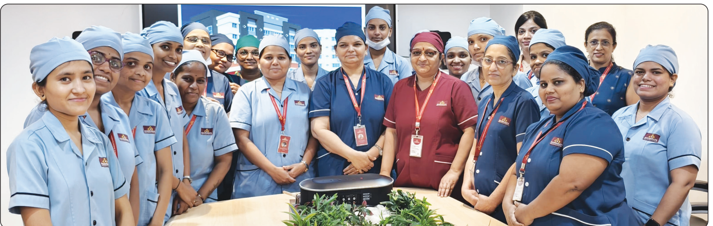
Kaushalya Hospital rings in Nurse's Day celebration on July 12.