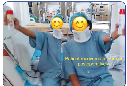
Patient recovered to normal postoperatively.

65-year-old female with history of trivial fall at home while working started complaining of severe neck pain and weakness in her both hands. She was not able to grip objects firmly in