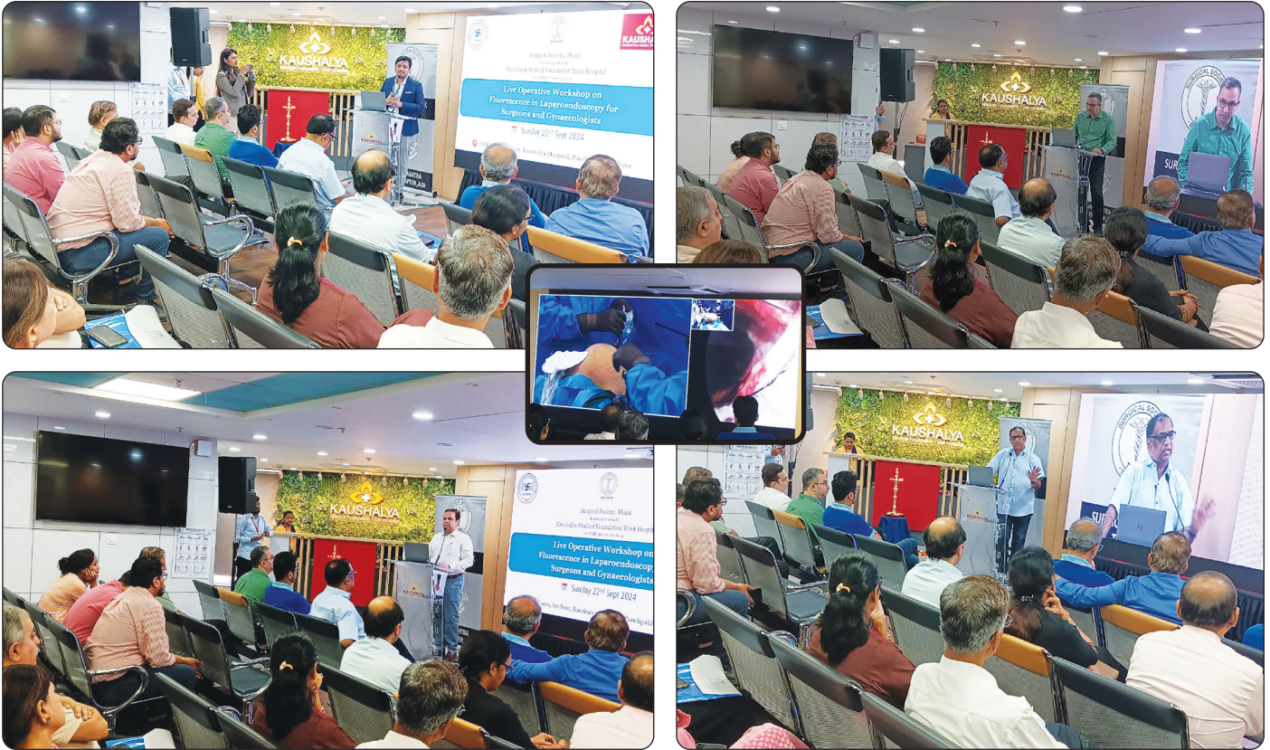
Surgical Society, Thane in association with Kaushalya Medical Foundation Trust Hospital (KMFTH) organised a live operative workshop on 'Fluorescence in Laparoendoscopy' for surgeons and gynaecs, on September 22, in the OPD area on the first floor of KMFTH.