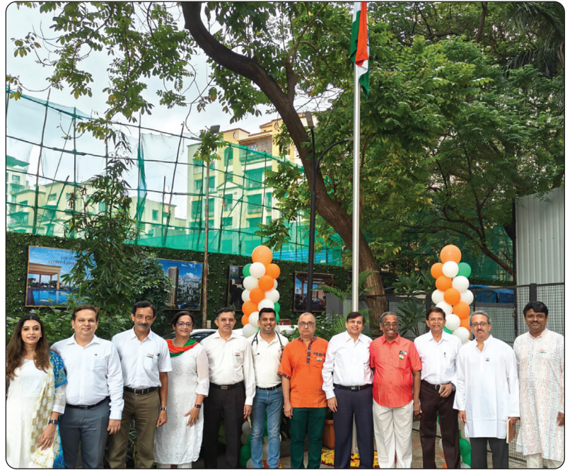
The staff of Kaushalya Hospital celebrated India’s 78th Independence Day with patriotic fervour.