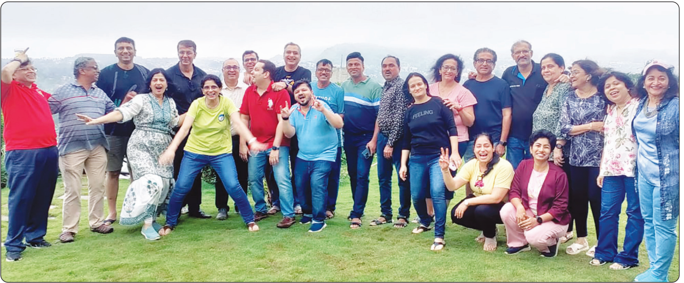
On August 25, Kaushalya Hospital arranged a monsoon picnic for its consultants to Rustic Highland in Lonavala. The doctors had an enjoyable time amidst the beauty of nature and entertained each other with heartfelt talks and other activities.